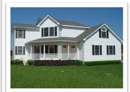
Victorian - Shown above with optional concrete porch with brick steps and family room in lieu of garage. Top right shown with optional side entry garage and window in front gable. Bottom right, shown with optional side entry garage, oval glass front door and decorative window in front gable.