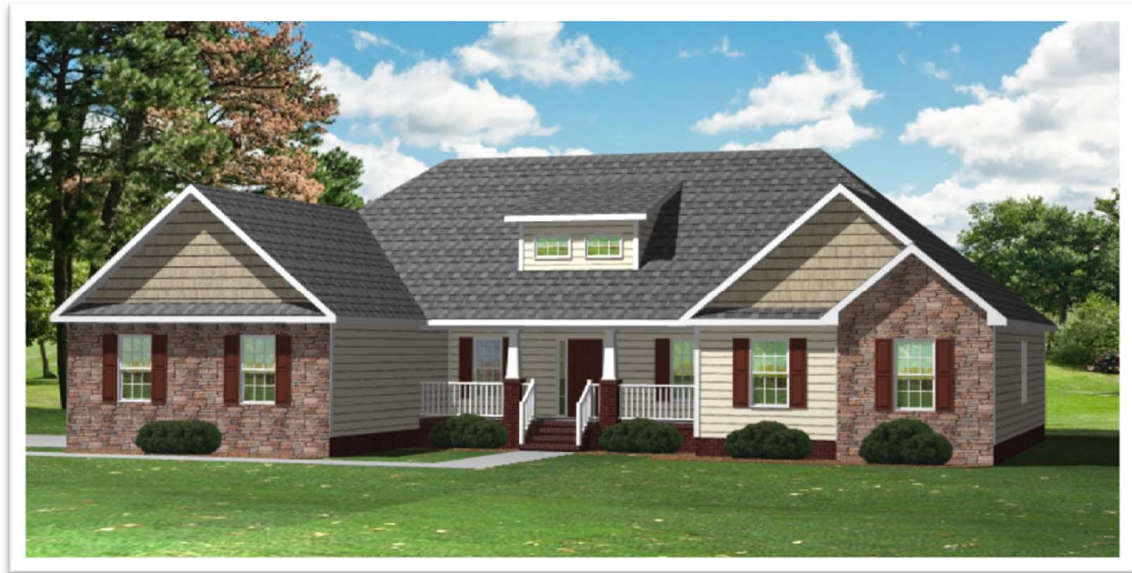
Ryan II - This updated model comes with numerous upgraded features, including a raised hip roof with dormer windows, craftsman style columns on a covered, concrete porch with brick steps and vinyl shake shingles in two front gables. Shown above with optional architectural shingles.