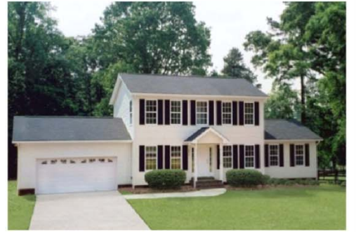
Randolph - Base price model shown above. Top right, shown with optional covered front porch and oval glass front door. Bottom right, shown with optional front entry garage and sidelights.