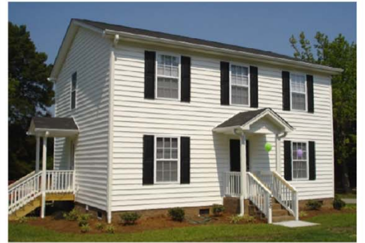
Peterson - Shown above with optional concrete porch with brick steps, sidelights and front gabled roof. Top right, shown with optional brick veneer, front door pediment around oval glass front door with sidelights, railing and additional first floor square footage. Bottom right shown with covered front stoop.