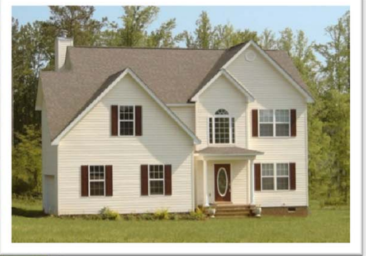
Mayfield - Shown above with optional wrap porch, concrete porch with brick steps and oval glass front door. Top right, shown with optional wrap porch. Bottom right, shown with optional fireplace and oval glass front door.