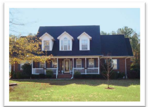
Lexington - All 3 versions shown with optional concrete porches with brick steps. Top right and bottom right shown with optional brick veneers and oval glass front doors; bottom right also features sidelights.