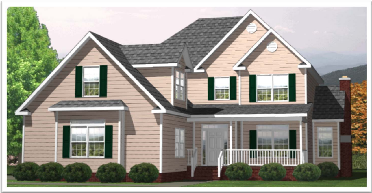
Jamestown - Shown above with optional concrete porch with brick steps, 9' ceilings, transom windows, bonus room, architectural shingles, front door transom with sidelights and a masonry fireplace.