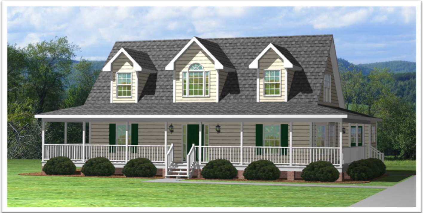
Hampton - Shown above with optional sidelights.