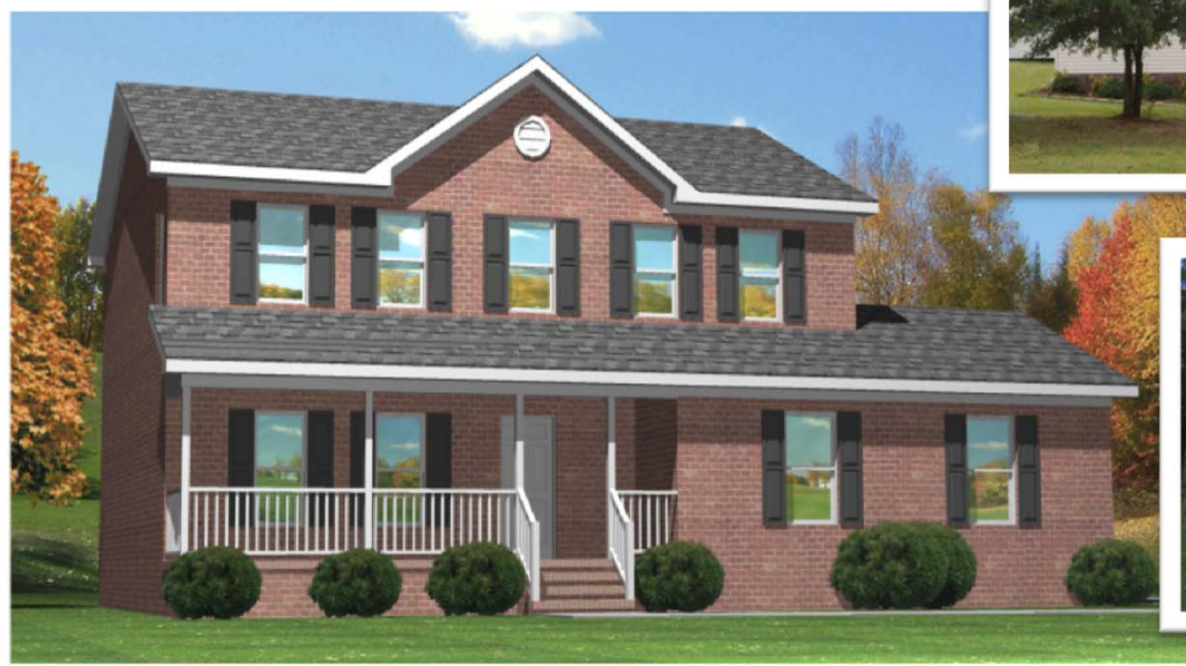
Arthur - Shown above with optional brick veneer, architectural shingles, front gable, side entry garage and concrete porch with brick steps. Top right, shown with optional sidelights and side entry garage. Bottom right, shown with optional side entry garage.